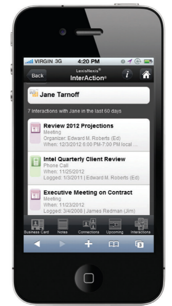
Who else is talking to my client and about what?